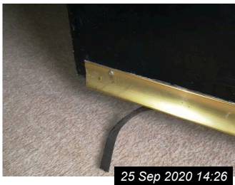
Ref # 5.2